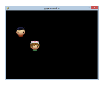
Fig. 2. Students experiment with avatar movement. The boy is controlled using the keyboard by the player and the girl is an AI agent.